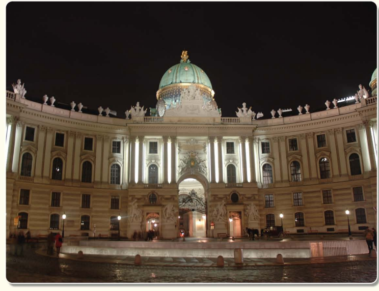
Austria is known as one of the richest countries in the world with high living standards

To know more visit our website www.opulentuz.com/immigration/austria Very highly qualified workers who have obtained a job search visa may apply for a Red-White-Red Card with the competent residence authority in Austria if they are able to submit an employment offer (work contract) during the period of validity of the visa. The competent authority can either be the Provincial Governor (Landeshauptmann), the Authorised Regional Administrative Authority (Bezirkshauptmannschaft) or the Local Administrative Authority (Magistrat).